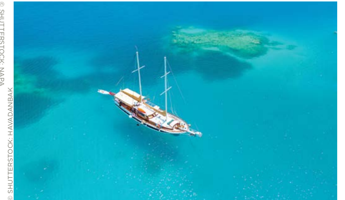
The islands are surrounded by pristine blue waters

Up until now, there has been no known transmission from any visitor staying at an Airbnb or a hotel to a local, and we intend to keep that record.