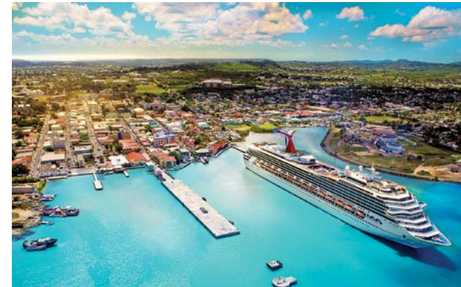
The country welcomes about 800,000 cruise passengers a year

Another area where investment is encouraged is in our agro-processing sector. In the context of looming global food shortages, cultivating and manufacturing food for local consumption and export is sensible.