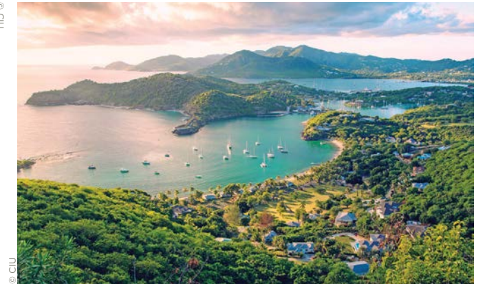
The sheltered English Harbour in the south of Antigua

In light of declining revenues from the tourism sector, successfully navigating the unprecedented challenges brought on by the pandemic and keeping the unit operational and efficient was a significant achievement for us and the country. When the country began to relax the lockdown protocols and welcome visitors, the safety risks to staff increased. As vaccines did not become available to the country until February 2021, we mapped out and implemented hybrid operations consisting of in-office and remote work. We worked two alternating teams in the office weekly with required redundancies on each team. We were fortunate to have our team vaccinated in the first round of vaccination administration, which made it easier to transition back to the office.