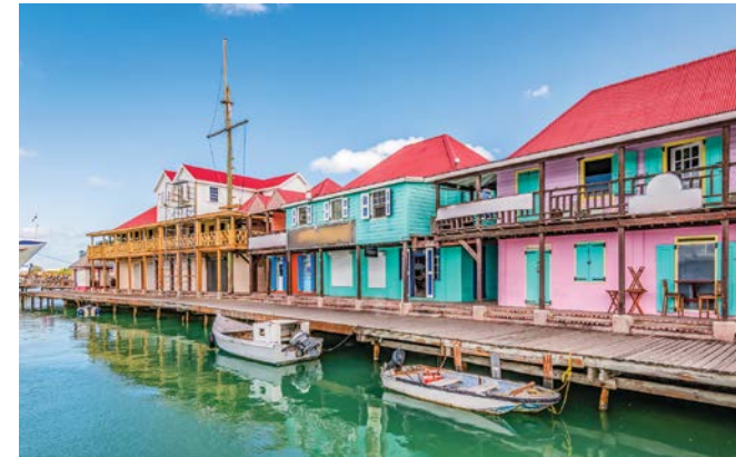
Antigua and Barbuda's colorful capital, St. John's

Currently, if you are fully vaccinated, you can come to Antigua with-