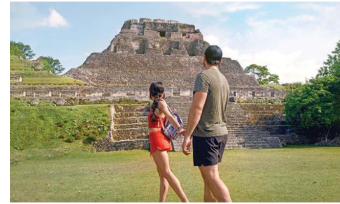
The incredible Xunantunich Mayan Ruins