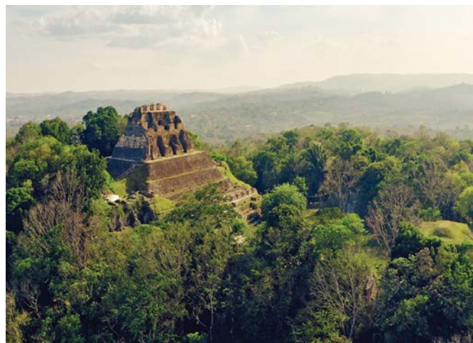
Belize is home to numerous Mayan ruins

coral formations and a rich abundance of marine life, particularly at Hol Chan Marine Reserve, which has been a protected area since 1987.