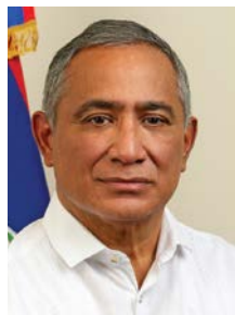
John Briceño Prime Minister

Sustainability is a key focus in Belize, with more than 50 percent of the country covered in lush rainforest. Its waters are also home to spectacular