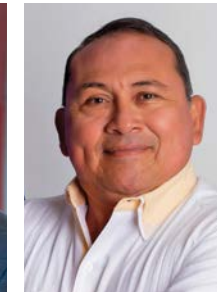
Andre Perez Minister of Blue Economy and Civil Aviation