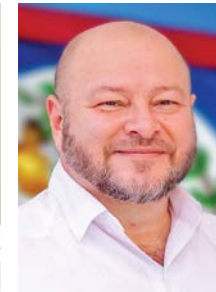
Michel Chebat Minister of Public Utilities