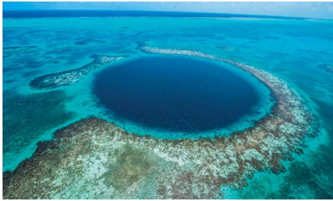
The Great Blue Hole is found in the Lighthouse Reef atoll

Due to the significance of the tourism industry in Belize, there are a number