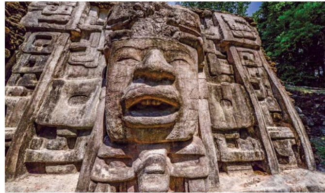
Lamanai Archaeological Reserve is a must-visit