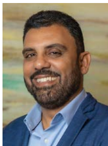
Anthony Mahler Minister of Tourism