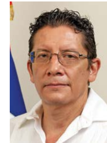
Christopher Coye Minister of State in the Ministry of Finance