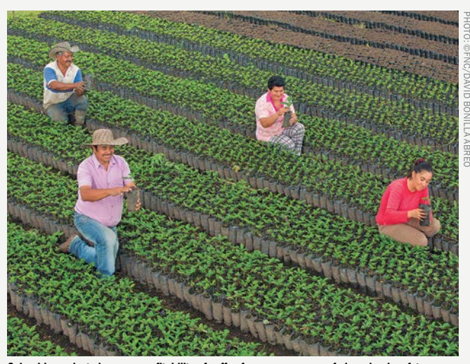
Colombia works to improve profitability of coffee farmers. www.federaciondecafeteros.org

companies such as Laboratorios Delta, foreigners will be able to receive innovative treatments for killer diseases such as lung cancer in Colombia. A leading logistics operator that imports highly sophisticated medicines and distributes to more than 15 countries in South America and the Caribbean, Laboratorios Delta is Colombia's sole authorized dealer of the groundbreaking therapeutic vaccine CIMAvax. CIMAvax has also attracted attention from the U.S., which is interested in licensing it.