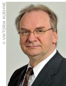
Dr. Reiner Haseloff Minister President

Saxony-Anhalt is an up-and-coming region and the arrival of Intel will make us one of the world's most strategically important business locations. The region is a fantastic area for investment, with not only the right economic conditions but also a long, rich history and a vibrant cultural landscape. For example, Saxony-Anhalt is home to the Nebra Sky Disc, which is the world's oldest representation of the cosmos, as well as being the birthplace of Martin Luther and the Bauhaus movement—it has been giving people the freedom to develop and put new ideas into practice for centuries. This spirit of innovation and forward planning is still here today, which is why our regional motto is “moderndenken” or “think modern”. We would like to invite anyone who wants to be part of Saxony-Anhalt's booming economy to take up the opportunities that our region has to offer.