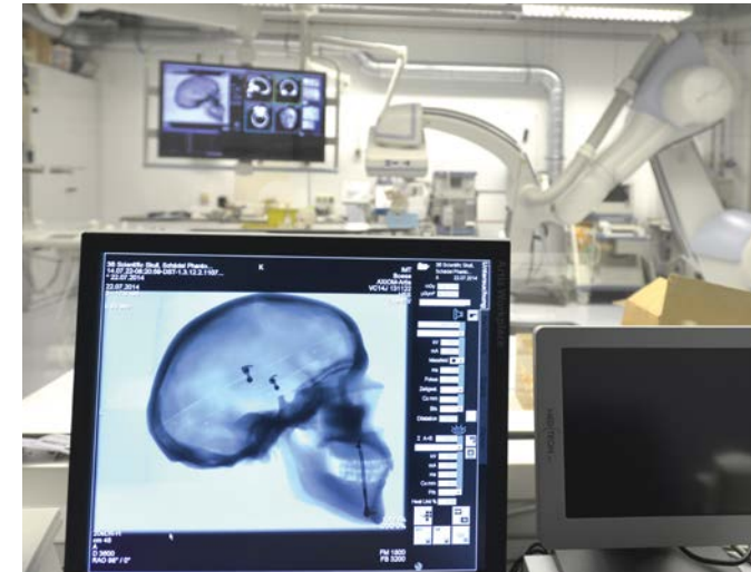
Saxony-Anhalt is a hotspot for medical technologies

As well as supporting businesses founded in the region, “bmp invests IBG funds in outstanding startups that aim to have a footprint in Saxony-Anhalt. Due to our approach, we’ve attracted several great startups to the state,” asserts Alberti. An illustration of this is Solar Materials, which has joined the region’s expanding circular economy to pilot and scale up its recycling technologies that economically recover all raw materials from obsolete solar panels. Two others are Conceptboard, whose online whiteboard for digital collaboration is now used by more than 2 million people in 100 countries, and Coman Software that spun off from a Berlin-based company with the help of $1.2 million in funding from IBG. Today, Coman’s process-management software for plant construction in the automotive, mechanical engineering, construction and other industries is an essential tool for global companies like Siemens, Daimler and BMW.