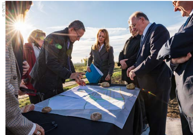
Intel CEO Pat Gelsinger with Dr. Reiner Haseloff in Magdeburg

Alongside that, other investment projects are underway. For example, the Finnish company UPM is building a €550-million biorefinery that will manufacture chemicals from wood. Because of its favorable position at the heart of Europe, Saxony-Anhalt is also becoming a popular location for the logistics industry and Avnet, one of the leading suppliers of electronic compo-