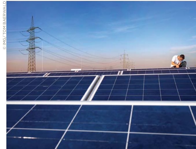
Europe’s Solar Valley is seeing a startup boom

A second benefit is well-established local sources of public and private funding, such as the state-owned Investment Bank Saxony-Anhalt and Mittelständische Beteiligungsgesellschaft Sachsen-Anhalt, whose shareholders are banks, insurance firms, chambers and business associations. The most prominent source is IBG Beteiligungsgesellschaft Sachsen-Anhalt, a state-owned venture capitalist with investment funds worth over $160 million that currently has around 50 tech-based companies in its portfolio. Since 2015, its funds have been overseen by the experienced German VC fund manager bmp Ventures. “We started investing in tech startups in 1997 and have a track record of over 250 investments, 100 exits and 20 initial public offerings. We’re hands-on VC