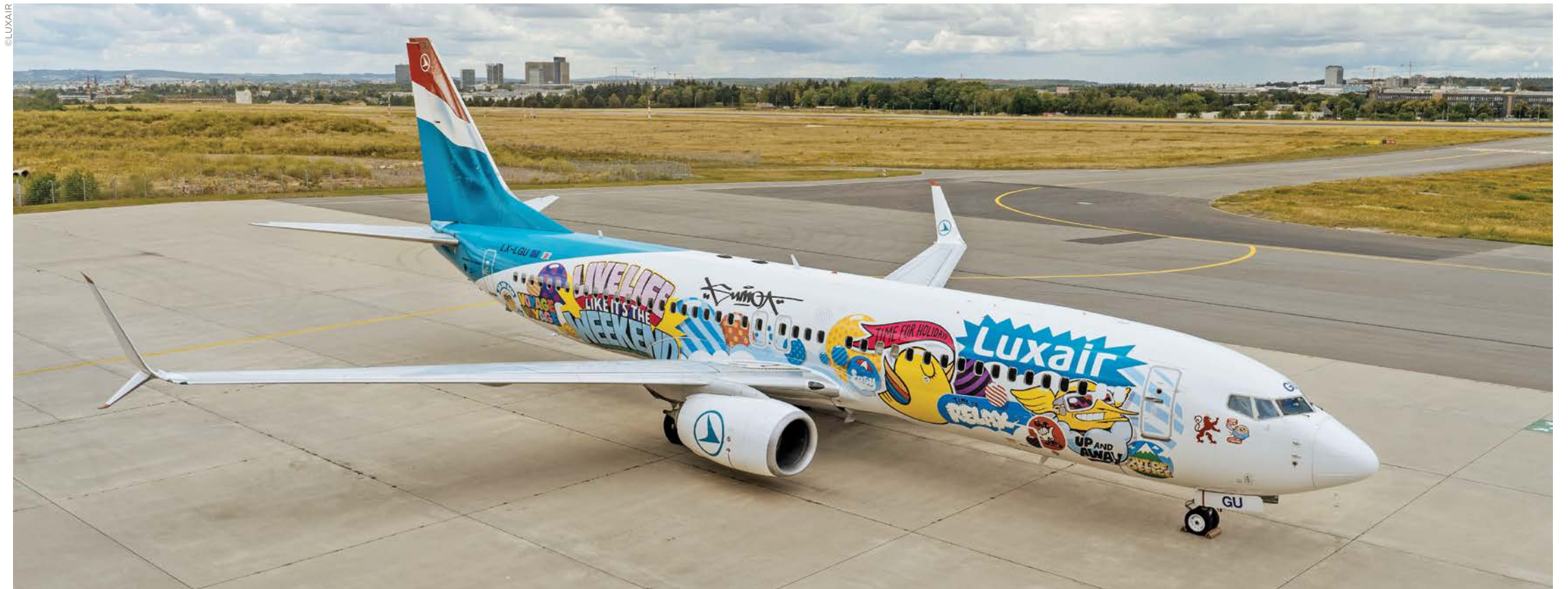
Luxair connects Luxembourg to Europe's key business centers and beyond

In keeping with the CEO's ethos of "doing the maximum", Luxair launched services to Dubai in early 2021, with the inaugural flight selling out in less than two hours. "That is when we decided we had to go for it and these routes actually saved us a bit from March to May, because