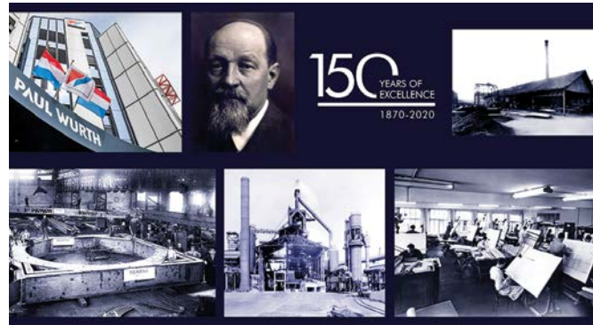
Paul Wurth celebrated its 150th anniversary in 2020

on conservation of fossil fuels. That put Paul Wurth and Luxembourg on the map among the leaders in the industry.”