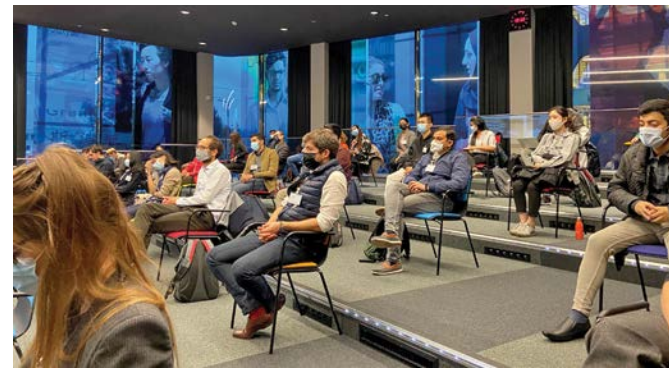
2021-22 class at LCL’s annual Young Logistics Professionals event

backgrounds such as economics, engineering or management, and will have spent time in the logistics and supply chain sector—they have a vision for their firms and are looking for additional education to achieve that.” Until this year, the master’s followed a single stream in operational management, but LCL has now established a second track and a chair in digital procurement. “Procurement is becoming a strategic role. You need to decide what you source locally versus globally, should you set up alliances with suppliers and so forth. These are complex questions that you can answer by leveraging data,” he explains.