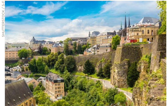
Per capita, Luxembourg is the world's second-wealthiest country

Despite expanding into new innovative areas, the lynchpin of an economy that recorded a 7-percent increase in gross domestic product last year is still a