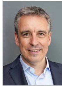
Claude Meisch Minister for Higher Education and Research