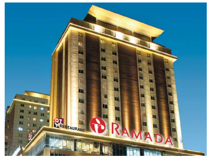
"Best hotel in Mongolia – recommended by Trip Advisor" www.ramada.com