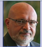
Josep Huguet Minister of Innovation, Universities and Business

This dynamic economic model is moving the city forward at a rapid pace as it invests hundreds of millions of dollars in modern transport and ICT infrastructure that will act as the foundations for future growth. In 2009, a stunning new passenger terminal opened at the busy international airport to welcome additional long-haul flights.