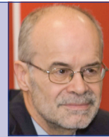
Antoni Castells Minister of Economy and Finance