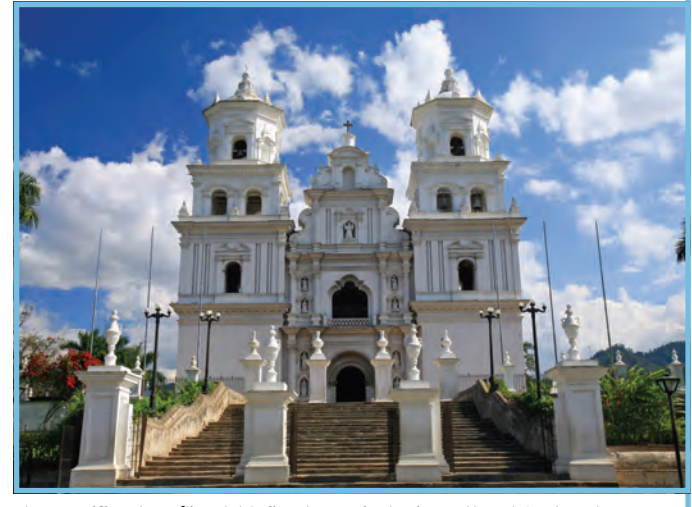
The magnificent Basílica del Señor de Esquipulas in southeast Guatemala

"Our colonial past retains an important presence in the 21st century, as shown by the attractive and historic city of Antigua Guatemala, while we also have the famous ancient