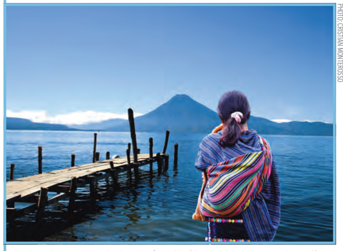
Guatemala's gorgeous landscapes form the ideal backdrop to a great vacation

opment of Sustainable Tourism, which gives priority to projects and programs centered on its wonderful natural and cultural heritage.