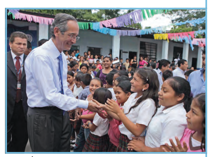
President Álvaro Colom during one of his regular visits to schools

Official statistics show the services industry generates around 20% of GDP, with that figure expected to jump sharply as FDI