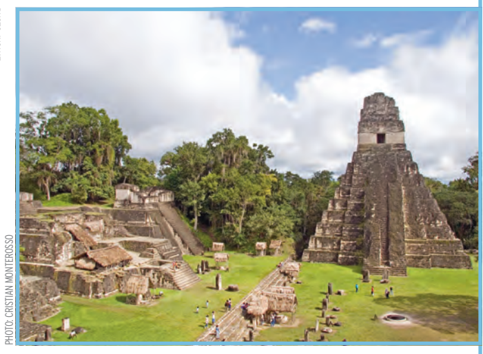
Mysterious Mayan temples are dotted throughout Guatemala's vast jungle

Considering this huge demand, the existing limited capacity and the diversity of tourism products and destinations