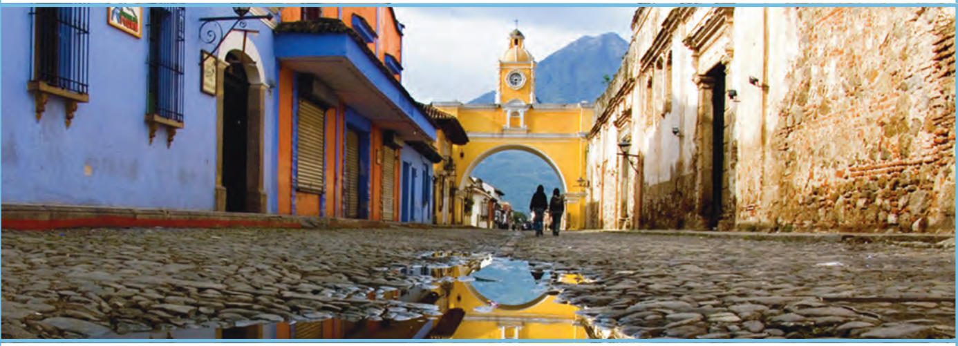
The cobblestone streets of Antigua Guatemala allow visitors to journey back in time to an era of conquest, grandeur, destruction and rebirth