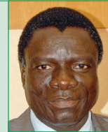
Maxwell Mwale Minister of Mines & Minerals Development