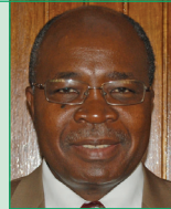
Situmbeko Musokotwane Minister of Finance and National Planning

Having gained independence from the U.K. in 1964, Zambia's ties with British companies are strong, as reflected in the number of U.K. firms already present in Zambia's industries and business sectors. With the discovery of oil and gas residues, the Zambian government is now inviting bids for a