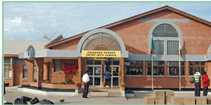
Golden business opportunities exist across the fast-growing Zambian economy.