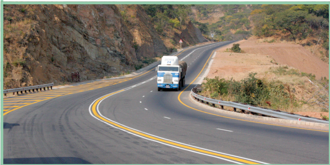
Zambia is inviting tenders for major infrastructure projects such as new roads.