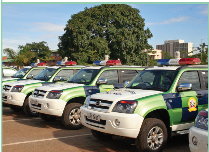
Facilitating an efficient and safer transport system in Zambia. www.rtsa.org.zm

An indigenous and forward-thinking business, I.C.C. is finalizing a strategic partnership with a Tanzanian investor that will give it U.S.$20 million in equity and debt in Q1 2010 and provide it with valuable ammunition in the battle with larger international banks.