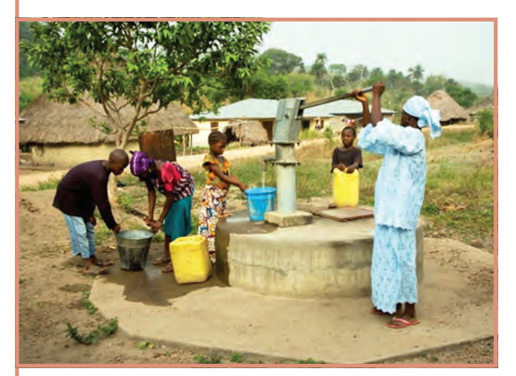
Meeting the needs of the people

well before Australia and Brazil, and he is committed to using his considerable experience to working with the country to build effective synergies, while making a positive impact.