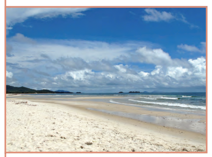
Pristine beaches along the Freetown peninsula

in terms of ICT, risk management and the like, to ensure differentiation and continuity in the control of the majority of accounts and businesses in Sierra Leone. I would like to see local participation as well."