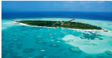
MEERU ISLAND RESORT & SPA www.meeru.com