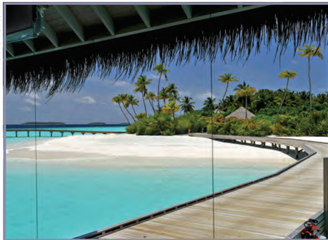
The turquoise water and white sands of the exclusive Anantara Resort and Spa

Having also achieved five out of eight of its Millennium Development Goals three years ahead of the 2015 schedule, British-educated President Mohamed Nasheed and his government are firmly focused on macroeconomic reform, public-sector reform, good governance, social development and adaptation to climate change.