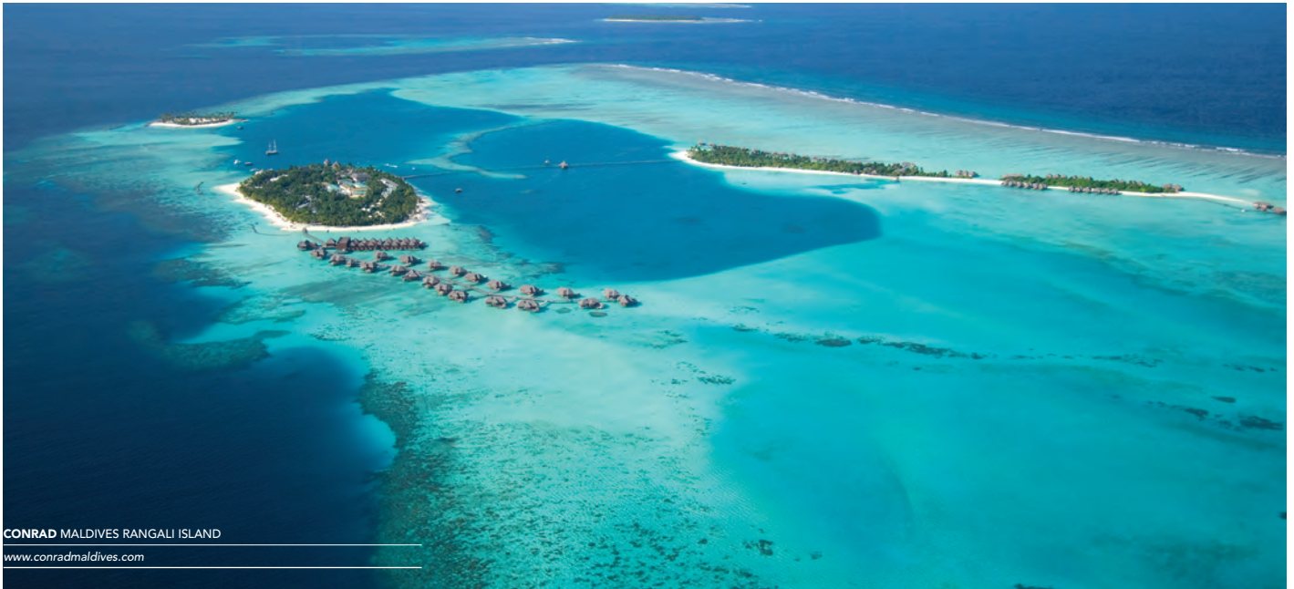
CONRAD MALDIVES RANGALI ISLAND www.conradmaldives.com

emerald specks enveloping turquoise waters, scattered beads of powdery beaches patching endless ocean, green palms swaying, crystalline lagoons giving way to white sands and shades of blue fading into pristine coral reefs.