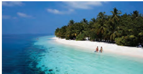
VILAMENDHOO ISLAND RESORT & SPA www.vilamendhooisland.com