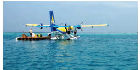
TMA TRANS MALDIVIAN AIRWAYS www.tma.com.mv

Crown Tours Your idea of the lifetime travel experience