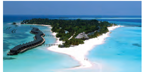
KUREDU ISLAND RESORT & SPA www.kuredu.com