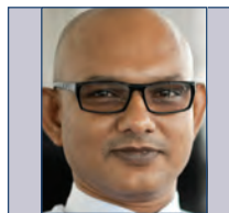
Mohamed Adil Saleem Minister of Transport and Communication

on a new submarine fiber-optic cable that will allow high-speed broadband access across the country.