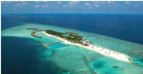
VELIGANDU ISLAND RESORT & SPA www.veliganduisland.com

WELCOME TO MALDIVES - THE MOST INCREDIBLE HEAVEN ON EARTH.