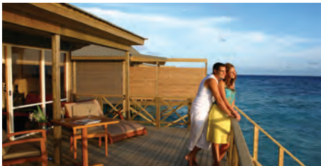
KOMANDOO MALDIVES ISLAND RESORT & SPA www.komandoo.com