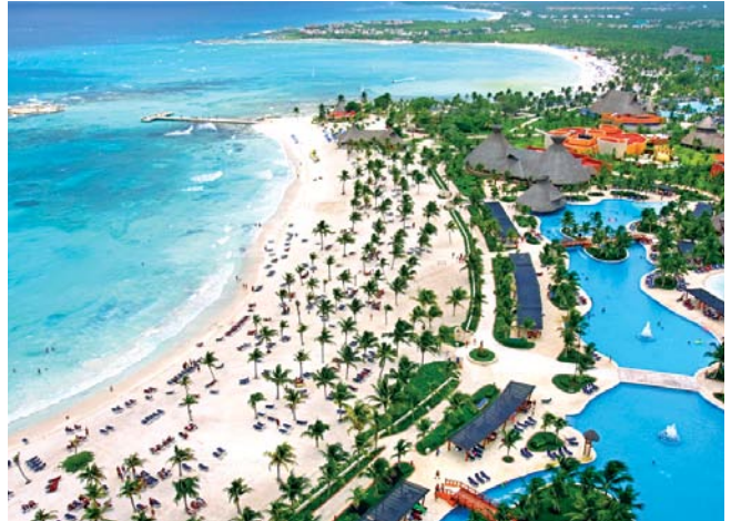
Barceló Maya Beach Resort, Riviera Maya.

"This year the Mayan culture will be celebrating its 5,125th year on December 21. As a result, we are expecting 52 million visitors to come and discover the Mayan Route. Quintana Roo is the gateway to