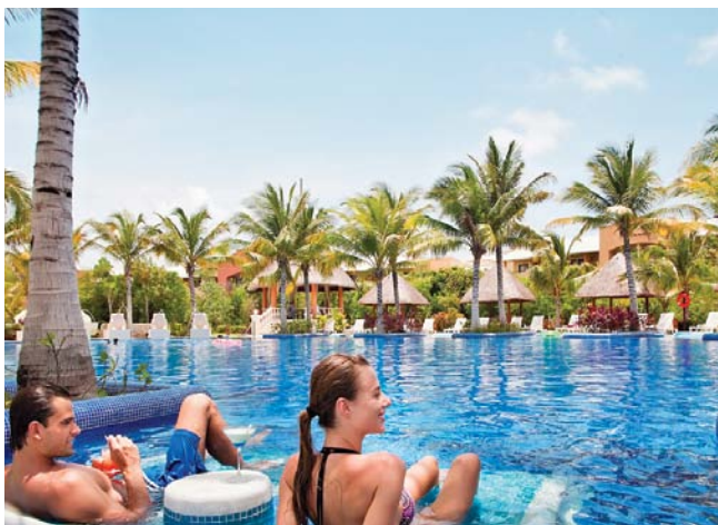
Barceló Maya Palace Deluxe, Riviera Maya.