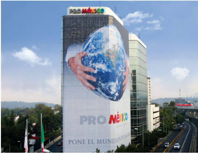
ProMéxico Headquarters, Mexico City