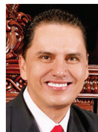
Roberto Sandoval Castañeda Governor of Nayarit

Meanwhile, in addition to serving as the country’s capital, political and commercial hub, the bustling, modern metropolis of Mexico City is one of the continent’s most important financial centers. Miguel Ángel Mancera Espinosa, mayor of Mexico City says, “Mexico City needs to improve in different areas to maintain its growth and development. Tourism, education, investment and safety are my priorities. We are working toward creating an alpha capital where everyone can find great opportunities for investing and where education and health care for children and elders play an important role. Mexico City receives a large number of tourists from inside and outside Mexico.