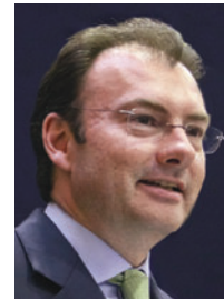
Luis Videgaray Caso Minister of Finance