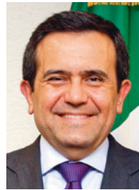
Ildefonso Guajardo Villarreal Minister of Economy

“The energy, fiscal and tax reforms will ignite the productive potential of our economy in the short, medium and long terms,” he states confidently. “The energy reform will bring great opportunities for growth and development through a virtuous cycle of public and private investment, employment generation and economic growth. There will be a reindustrialization of the country due to the increase in the supply of