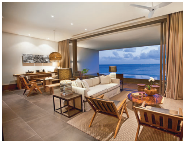
NIZUC Resort & Spa

Speaking at an event in Coahuila state in October to mark U.S. auto manufacturer Chrysler’s latest additional investment of $164 million in