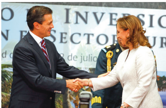
President Enrique Peña Nieto and Tourism Minister, Claudia Ruiz Massieu Salinas