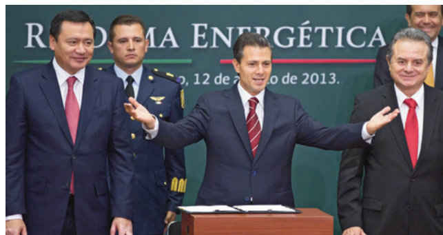
Interior Minister Osorio Chong, President Peña Nieto and Energy Minister Joaquín Coldwell

Rich in natural resources and boasting a myriad of investment opportunities, Mexico offers a wealth of business openings in a wide