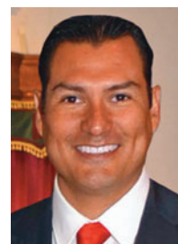
Mauricio Trejo Pureco Mayor of San Miguel de Allende

energy potential, especially in renewable energies. Most of the energy consumed in the country comes from our dams, and we also produce oil, gas and natural energy such as wind power. We are very excited about these reforms, as they will open up the market and encourage FDI in Chiapas. We are confident that with these key structural reforms we will increase our socioeconomic level within Mexico.