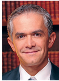
Miguel Ángel Mancera Espinosa, Mayor of Mexico City

Mexico's entrepreneurial spirit is evident across its entire industrial and commercial spectrum, with products featuring the words "Made in