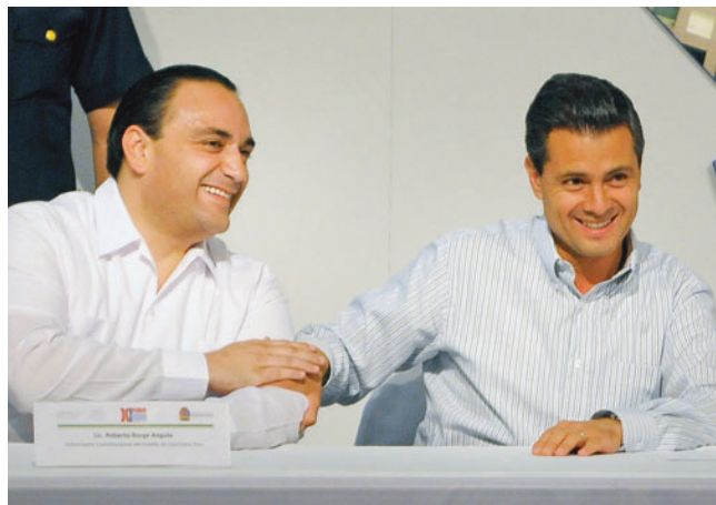
Governor of Quintana Roo Roberto Borge Angulo with President Enrique Peña Nieto