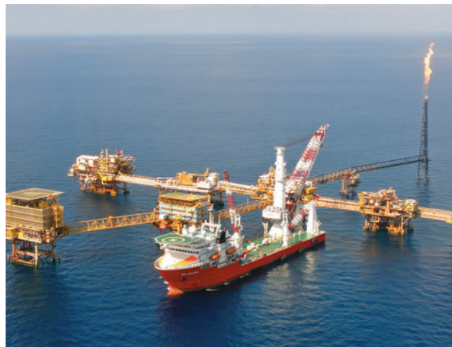
Oceanografía: leading the way in Energy.

Oceanografía's fleet features dynamic positioning systems, crane systems, saturation systems for diving, mud processing plants to support drilling rigs, Remotely Operated Vehicle (ROV) systems and subsea pipeline routing systems.