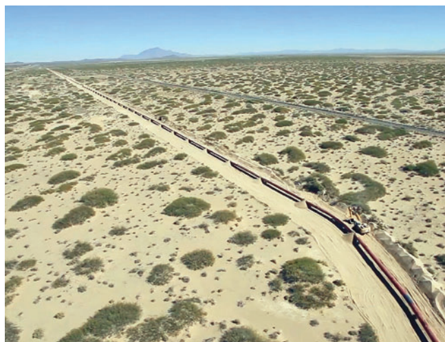
Chihuahua Corridor, Tarahumara Pipeline