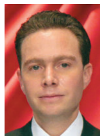
Manuel Velasco Coello, Governor of Chiapas

Manuel Velasco Coello, governor of the state of Chiapas, says: "The energy and fiscal reforms are very important to us as we have a lot of