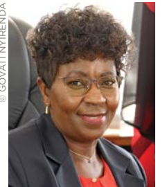
Agnes NyaLonje Minister of Education

Our overall vision is to focus on areas of the system that need fixing and reforming. It's time to look at early childhood education, which is very informal at the moment. We want to make it more formal because we realize that a lot of the challenges we face in education might be resolved if we start shaping young minds as early as we can. Then, we want to focus on improving primary education, where we have done very well at expanding access but we lack quality. We need to improve the skills of teachers and provide infrastructure that allows us to improve on quality. The biggest challenge in secondary education is to increase access. For us to produce the kinds of graduates we need in the numbers required, we will have to expand our enrolment rate substantially to put Malawi on the road to becoming a middle-income country. At the same time, given that over 75 percent of our population is very young, we need to improve on our technical education. If we can do all of this, I have no doubt that we will reach a point where education drives Malawi's transformation. Of course, we need more resources but we are committed to finding those and also to working better with the resources already in our care.