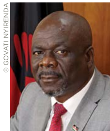
Newton Kambala Minister of Energy

The main electricity projects under consideration that are open to international operators are our regional power interconnector projects. Currently, the Mozambique-Malawi Regional Power Interconnector is at an advanced stage. Its objective is to interconnect the two countries' transmission systems to enable them to engage in bilateral and regional power trade in the Southern African Power Pool. Financing for this interconnector has been fully secured and procurement of contractors is underway, with the project expected to be delivered in December 2022. Another regional interconnector project under consideration is the Zambia-Malawi interconnector, which is at the feasibility study stage. Finally, our Tanzania-Malawi interconnector project is yet to roll out, but it will be significant to Malawi because it will be used to tap power from the Eastern Africa Power Pool. On the generation side, there are projects that have already been declared feasible and that the government has decided will jointly be implemented with private sector because of the huge resources required. These are the 350MW Mpatamanga, 210MW Kholombidzo, 261MW Fufu and 180MW Songwe hydropower schemes.