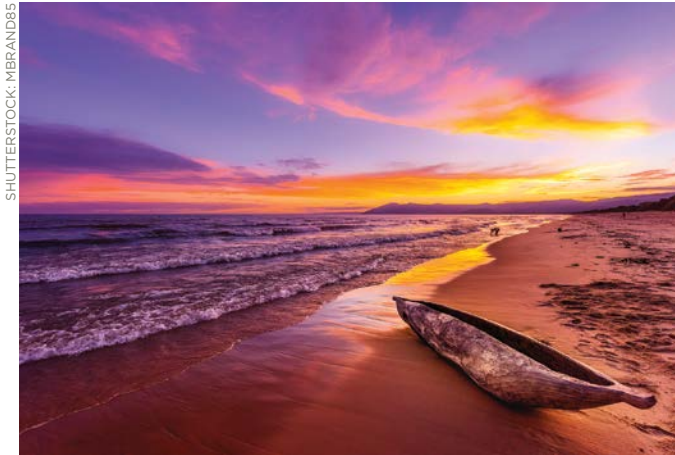
Stunning Lake Malawi is the third-largest freshwater lake in Africa

Malawi has close working relationships with multilateral organizations and international donors. Do you plan to modify these relationships in any way?