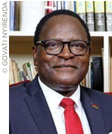
Lazarus Chakwera President

As part of global humanity, Malawi is no exception in having been adversely affected by COVID-19. There will be adjustments that we have to make, but we must also work in a hard and smart way in order to foster growth. We have many resources that, if we manage them well, can enable us to develop. The pandemic changes the trajectory of this development and we will have to adjust just like every other country. Nonetheless, I believe this is a temporary lapse and we need to be thinking beyond this to ask ourselves what we can do over and above the average that everybody expects in order to have growth.