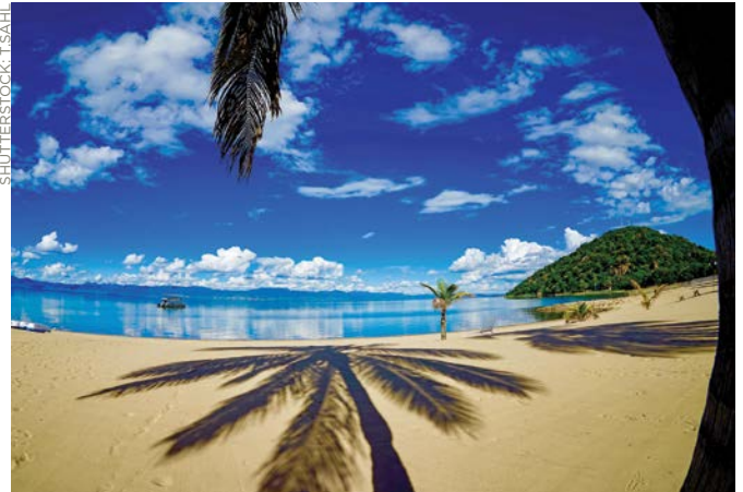
A hotel and golf resort is being developed at Cape Maclear

One park is located on a UNESCO World Heritage site: Lake Malawi, Africa's third-largest freshwater lake that contains idyllic island hideaways with golden sands and luxury lodges. On its clear blue waters, you can enjoy unbeatable water sports and marvel at a globally unparalleled number of native fish species, including kaleidoscopic cichlids. Alternatively, head up Mount