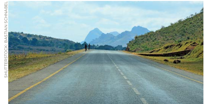
Transport infrastructure is one key development area for Malawi

Launched in 2017 and due to conclude in 2022, MGDS III is seen as the final link in the chain that will elevate Malawi to the realization of its Vision 2020, its authors note. Good governance through greater transparency, accountability and strengthening of institutions is one core component of the blueprint, with several key areas placed at the heart of the ambitious socioeconomic roadmap. "Effective implementation of the five key priority areas will translate into integrated impacts, which will affect other sectors