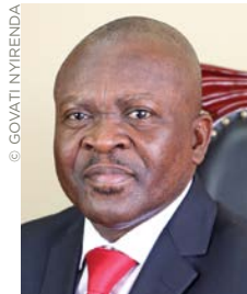
Michael Usi Minister of Tourism, Culture and Wildlife

First, Malawi's diversity gives a complete African experience to those looking for something new and authentic away from more crowded destinations like Kenya and South Africa. Second, the distances between attractions here are shorter, meaning that one can be at a national park during the day and watch the sunset over Lake Malawi by evening. Third, the warmth and friendliness of the people of Malawi are legendary, which is why we are known as the "warm heart of Africa." Furthermore, our culture is not only diverse but also very rich as we have various ethnic groups and tribes. Fourthly, we are the only country in the region that offers an inland island experience, with water-based activities such as fresh water scuba diving, kayaking and snorkelling. My fifth reason would be our globally acknowledged, successful conservation and wildlife revival that has gained us the status of Africa's newest Big-Five destination.