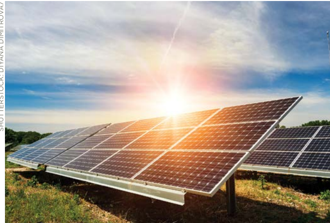
Malawi receives an average of 3,000 hours of sunshine a year

Private-sector investment is also seen as vital and major reforms have been carried out to encourage this. The industry has been liberalized to let independent power producers enter the market, with an attractive framework in place