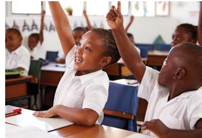
The primary school enrolment rate is now up to 80 percent in Malawi

Agnes NyaLonje, Minister of Education, introduces the government's strategy for the sector