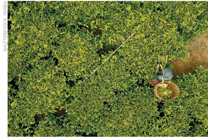
Malawi's most important crops include its world-class tea

very cheap farm supplies such as fertilizer and seeds. Another important initiative is the Women and Youth Loan Program that is expected to support the creation of 200,000 new enterprises run by those demographic groups.