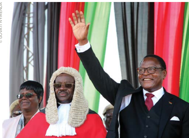
President Lazarus Chakwera won the election with 58.57 percent of the vote

“Accordingly, as we enter the decade of action, which is the last ten years of the implementation of the agenda 2030, my government continues to work with the United Nations’ system and other development partners in all priority areas of SDG acceleration. Malawi is focused on implementing those SDGs with multiplier effects on others in order to maximize scarce resources and stakeholder participation. We are proud to have