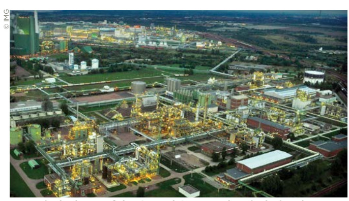
Leuna is the heart of the Central German chemical triangle

Powered by solar and with an on-site facility producing methane from maize, Zeitz Chemical and Industry Park is also making a name for itself as a location for green chemistry, particularly in relation to water-intensive industries. On the site at the moment, for instance, Ukraine's Interstarch is