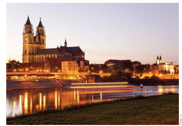
The oldest Gothic cathedral in Germany is in Magdeburg

One crucial advantage for international companies, entrepreneurs and others is the incredible quality of life on offer in welcoming Saxony-Anhalt. For instance, there are abundant career opportunities in future-focused businesses and institutions. It also leads its nation in services for parents, with all children up to the age of 14 having a statutory right to full-day care. Living, land and housing costs are substantially below the German average as well, while world-class internet connections are available in vibrant, cosmopolitan cities and the region's idyllic countryside, which helps explain why almost 32 percent of all startups are based in rural communities. Saxony-Anhalt is stunning in terms of both its natural environment and its vast cultural