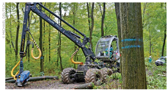
Much of Saxony-Anhalt is covered in sustainable forests

Among the latter is UPM, which is currently building an industrial-scale biorefinery on a 1,300-hectare site in the Chemical Site Leuna industrial park to produce green basic chemicals from sustainable hardwood grown in the region. UPM's €550-million investment project, which was named Bio Act of the Year at the World BioEconomy Forum 2020, will pump out 220,000 metric tons of biochemicals every year that will enable its clients in plastics, textiles, cosmetics and other industries to move away from fossil-based alternatives. UPM is joining a thriving refinery sector