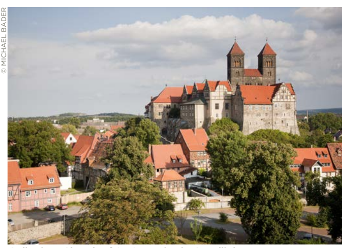
Collegiate Church of St. Servatius in Quedlinburg