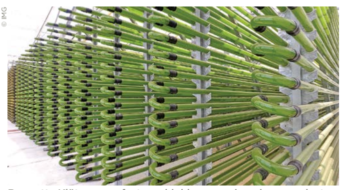
Roquette Klötze manufactures highly pure microalgae products

Algae deliver numerous advantages in comparison to other natural sources of ingredients: they can be cultivated all year round in bioreactors rather than on scarce agricultural land, while they also reproduce faster, produce larger harvests and capture more carbon dioxide than many traditional crops. And alongside compounds like vitamins, proteins, dyes and carotenoids, some generate omega-3 fatty acids, making them a vastly more sustainable option for obtaining those vital nutrients than the depleting fish stocks in our oceans. What is most exciting about the organisms, however, is how much there is still to discover, Griehl enthuses. "53,000 species have been classified to date and we know little about their ingredients, with only about 15 microalgae currently being used in industry. One way the university is working to solve that is by constantly building up our own collection of worldwide strains for our research." Griehl highlights two projects her team are engaged in to illustrate the diversity of its research. The first is the development of a blue beer that not only tastes great, but could also have