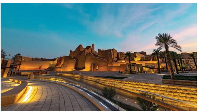
At-Turaif, a UNESCO World Heritage Site