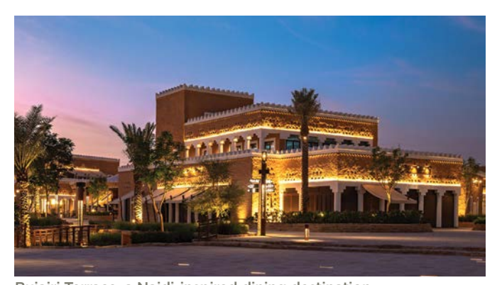
Bujairi Terrace, a Najdi-inspired dining destination

SAUDI ARABIA CONTENT FROM COUNTRY REPORTS CONTENT FROM COUNTRY REPORTS SAUDI ARABIA