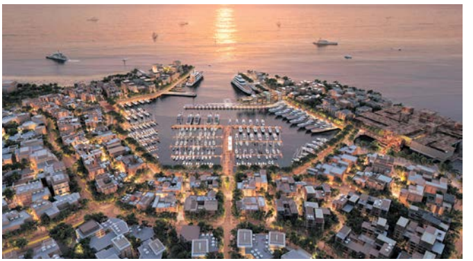
An attractive new marina will provide easy access to the Red Sea

Most global downtowns are based on a conventional grid layout. Jeddah Central's design is inspired by Al-Balad, so this is not just about getting from A to B but reflects a cultural and social purpose. The distinct laneways, squares and meeting places that locals call sikkas and barahats provide unexpected discovery around each corner, bringing people together, ensuring everyone is part of a community, not apart from it. This brings a cultural vibrancy and soul to a contemporary development rarely seen across other cities and developments, essentially making people feel that they belong to something rich and powerful.