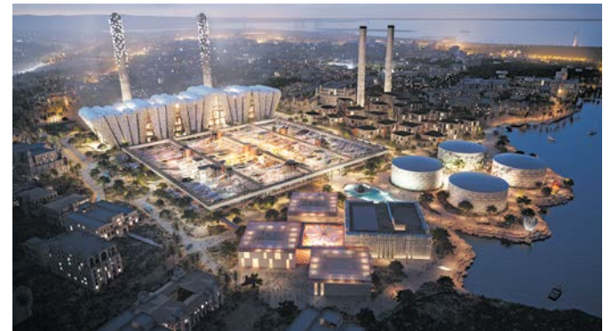
A new industrial museum will preserve the old desalination plant

Our uniqueness comes from the local heritage and design of Al-Balad and we know visitors are always drawn globally to the laneways and cultural discovery that old towns provide. With a design that naturally blends with architecture, flora, fauna, land and sea-scaping, Jeddah Central is set to be the leisure lifestyle destination of the kingdom.