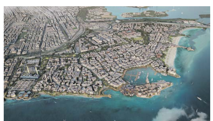
Jeddah Central will use themed districts as a rich tapestry of life

The first phase will be fully open in 2027 and by 2030 Jeddah Central is set to create 25,000 direct and indirect jobs with over $12-billion gross value added to the economy. Jeddah is the second-largest city in Saudi Arabia, with a temperature rarely below 15°C or above 40°C, making it a welcoming, waterfront haven for leisure visitors and locals. As the gateway